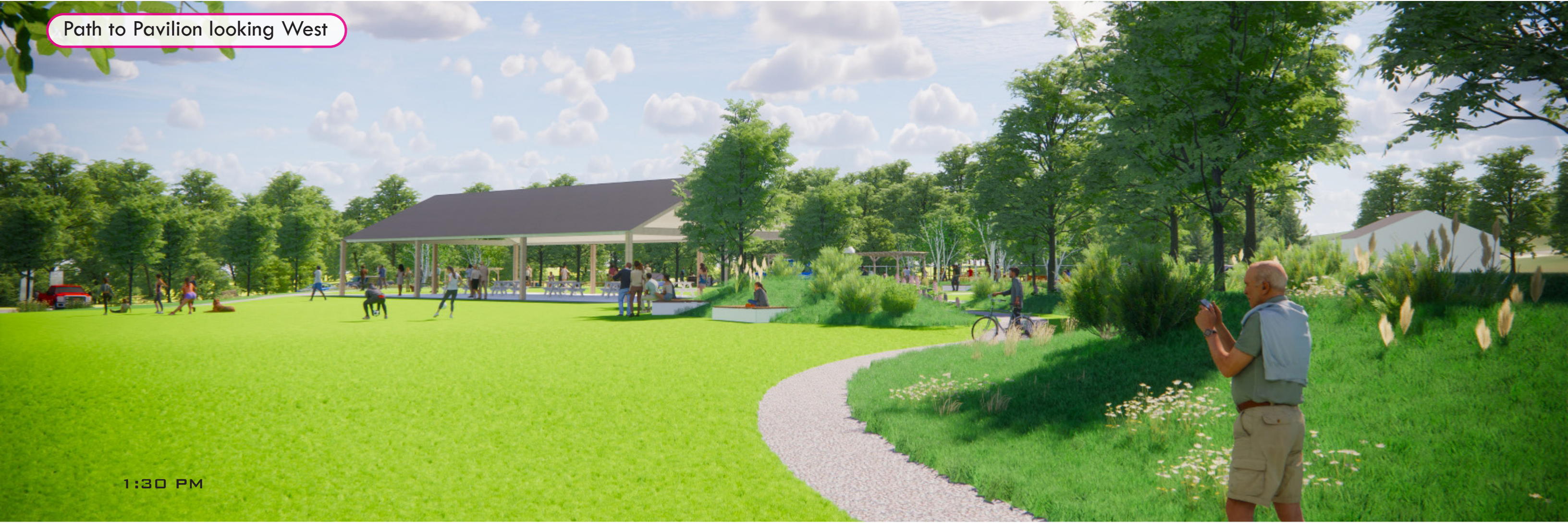
Path to Pavilion looking West