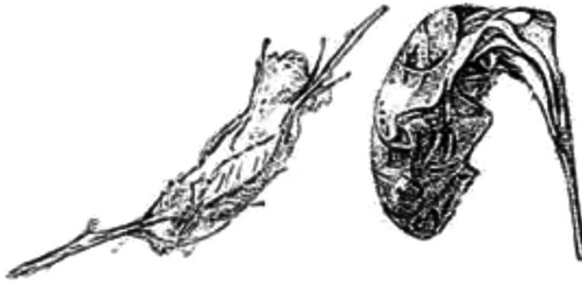
Example of browntail moth winter nests.

B rowntail moth winter webs were identified in Bowdoinham during the 2021 survey. The new webs for 2022 can be removed and destroyed to prevent further infestation. The Maine Forest Service recommends learning to property identify browntail moth webs to avoid harming other non-invasive species. Winter webs can be pruned from the trees by an arborist or pest control specialist and destroyed by immersing them in a bucket of soapy water.