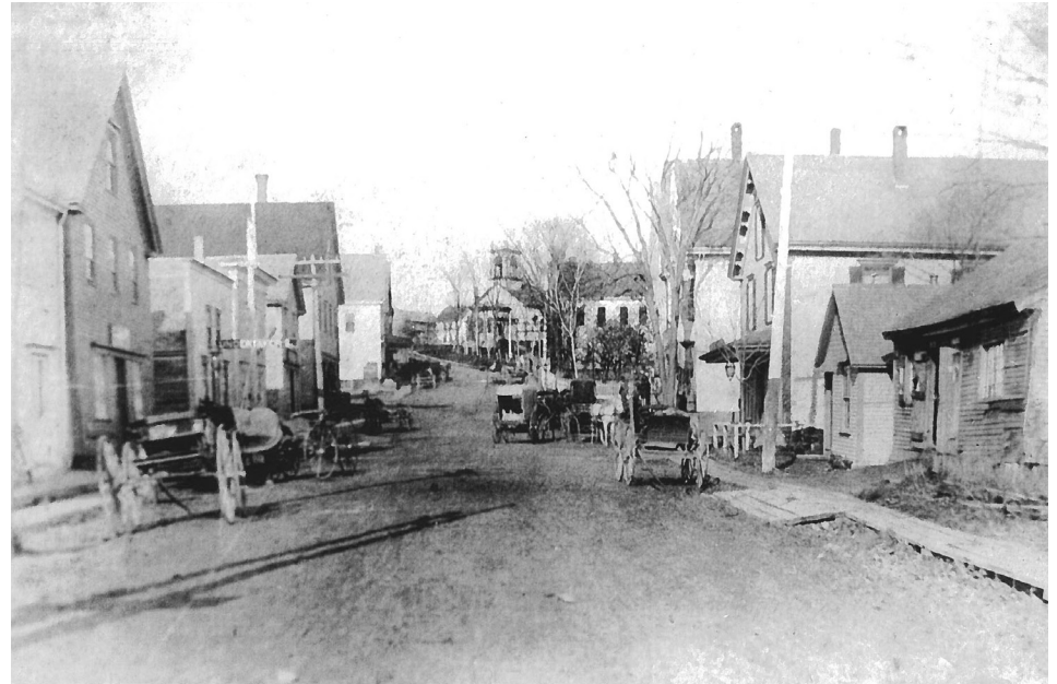
Lower Main Street, prior to 1902 fire