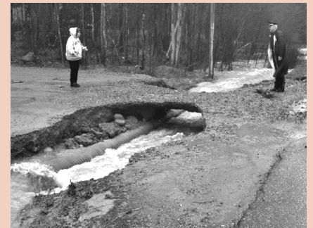
A road washout in Ellsworth caused by a clogged culvert left residents stranded for several hours.

If a drain is still clogged after clearing surface debris or if you have questions or concerns about a culvert near your property, please contact Public Works at (207) 666-3503 or pworks@bowdoinham.com