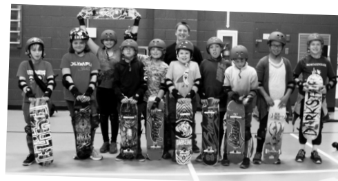
2017 Spring Skate Elective