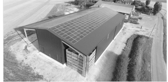
Example of solar array on an industrial type building

How will this be purchased? Through a Power Purchase / Net Energy Billing Credits Agreement (PPA)