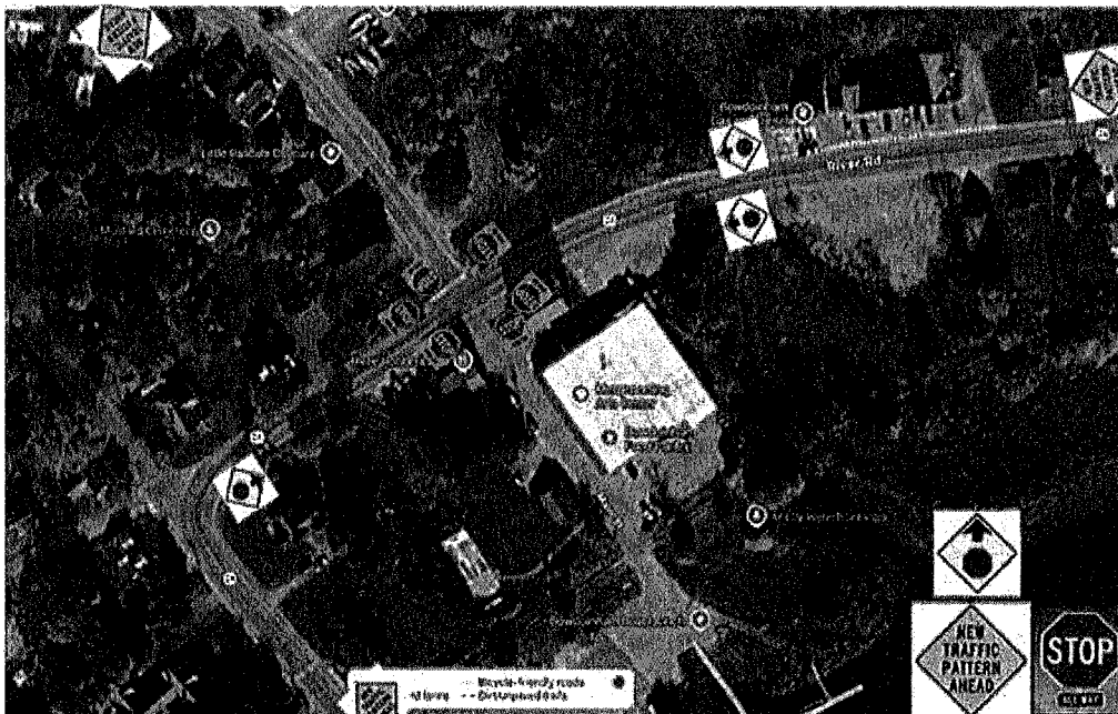
Figure 1. Indicates location of the All Way Stop and associated signage.

The project will include adding four new stop signs on either side of the intersection along Route 24 with double up placement. All way stop placards will be placed at all six stop signs. Additionally, three stop ahead signs will be placed along Route 24 in advance of the stop signs as indicated on image 1 below. One will be located on the southern end of Route 24 along the north bound lane as the curve approaches and the other two will be doubled up on Route 24 north of the intersection. Lastly, three new traffic pattern signs will be installed. One on Main Street, west of the intersection along the east bound lane before a curve, another located on the south bound lane of Route 24 before the stop ahead signs, and another on the northbound lane of Route 24 prior to the stop ahead sign near the Brooklyn Bridge. Please see the image below for more details.