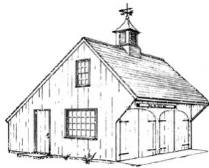
Proposed Carriage Shed