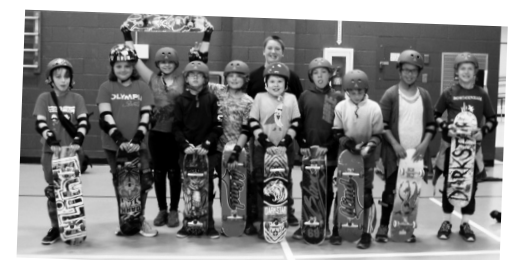
2017 Spring Skate Elective