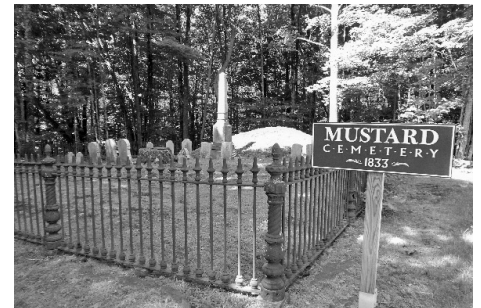
Mustard Cemetery (Gr25)

Help support our youth league sports with a little advertising. From reaching all 1,400 homes in Bowdoinham, to regional exposure with our traveling teams, your funding will grow your business and our home teams! To score one of these deals respond by November 14, 2025!