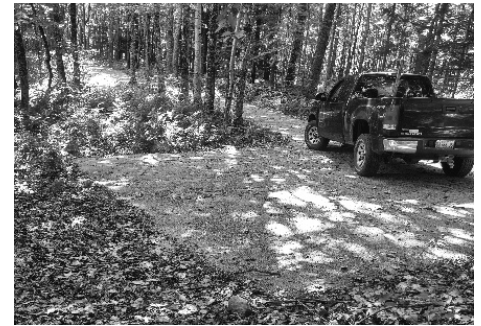
Row for Temple-Randall Cemetery (Gr32)