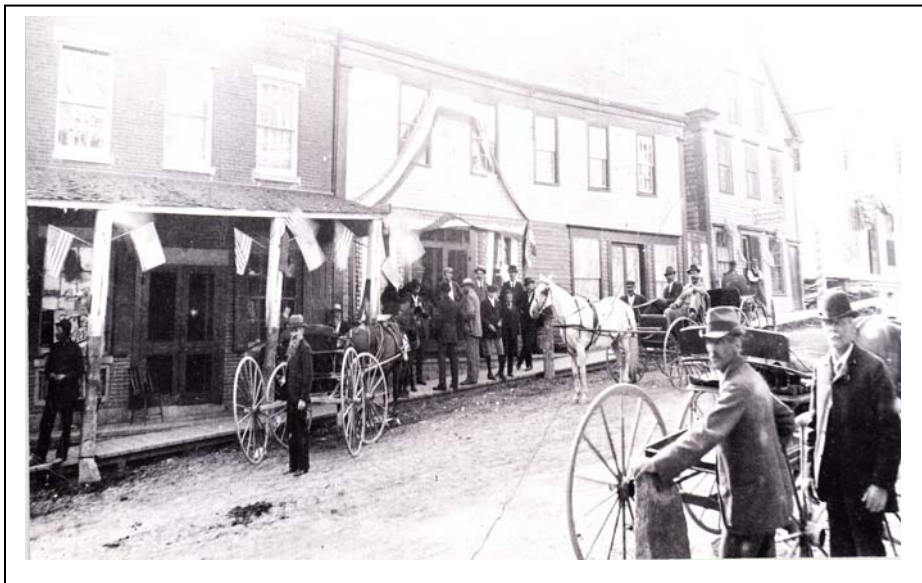
Wooden sidewalks once graced the village

At one time, Bowdoinham village was served by a network of sidewalks, as suggested in the historical photo shown below. These early sidewalks appear to be made of wide planks that probably didn't last long. At some unknown point in time, they were replaced by concrete. Remnants of the old, concrete sidewalks exist today, but for the most part they have disappeared under lawns or were removed altogether. The decline and disappearance of these walkways didn't happen all at once, but were the likely byproducts of years of neglect and lack of funds for maintenance. The ascendancy of the automobile likely coincided with a perception that sidewalks were no longer very important as a means for getting about. In recent years, however, more and more people have realized the importance of physical exercise, the benefits of living in a community where you can walk safely and meet your neighbors, and the importance of conserving energy, reducing pollution and saving money by not having to rely on motor vehicles for all of your errands.